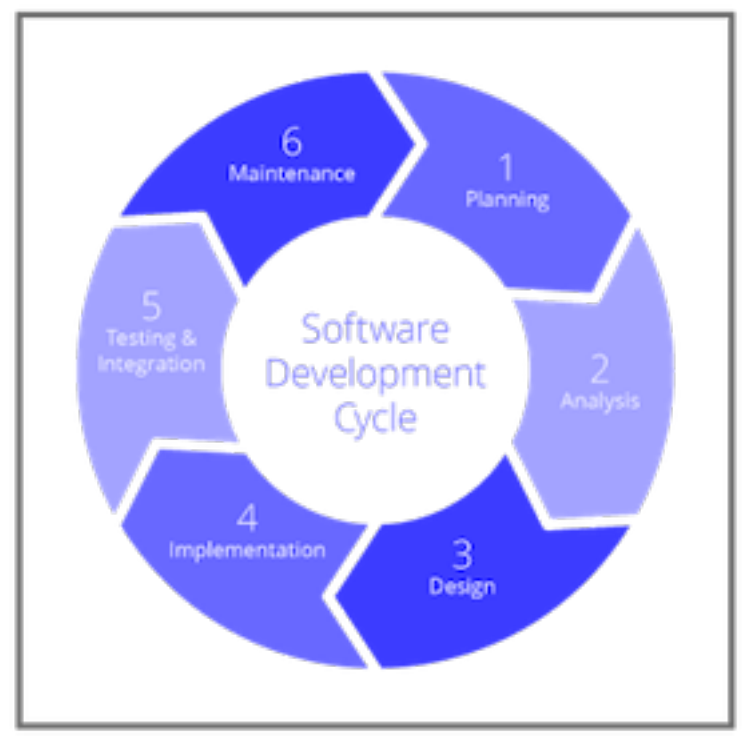
A typical SDLC representation

Overview Almost all modern software is developed in an iterative manner passing through phase to phase, such as identifying customer requirements, implementation and test. These phases are revisited in a cyclic manner throughout the lifetime of the application. A generic Software Development LifeCycle (SDLC) is shown below, and in practice there may be more or less phases according to the processes adopted by the business.